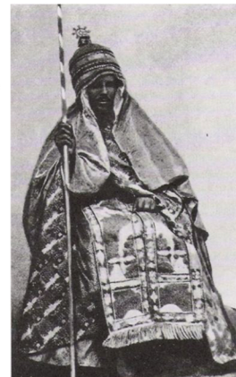
Tigray people also wear fringes (Yohannes IV)