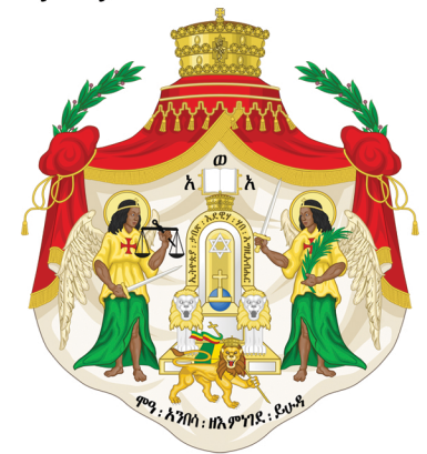
Ethiopia's Imperial Coat of Arms

The Habesha People and Abyssinians make up 35% of Ethiopia's population Tigrayan Amhara Beta Israel. Habesha people are known as a Semitic people that derive from Shem, one of Noah's sons. Their bible contains some books from the original KJV Apocryphal books. They keep the Sabbath Holy. (Saturday) Exodus 20:8 & Exodus 31:13 KJV Follow the dietary law abstaining from pork Leviticus 11:7 . Women cover their head in the church. (1 Corinthians 11:1-3) Beta Israel (also known as Habesha) practice post birth abstinence from their spouse. Forty days for a boy and eighty days for a girl. (According to Leviticus 12:1-5 )