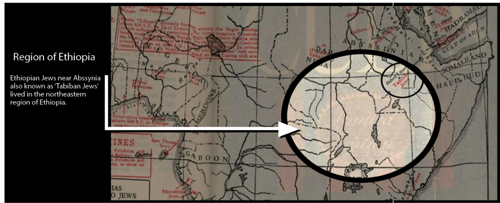
Region of Ethiopia

Ethiopian Jews near Abyssinia also known as 'Tabiban Jews' lived in the northeastern region of Ethiopia.