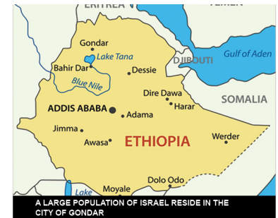
A LARGE POPULATION OF ISRAEL RESIDE IN THE CITY OF GONDAR

Similar to the Levites, Certain Ethiopian Jews were known in Tigrinya as bahtawi (Amharic: melokse) - a kind of high priest. Each Bahtawi lived in solitude, apart from the community, because he followed an extreme regimen of ritual purity. The last Bahtawi died years ago in Israel. In Ethiopia, some still retain customs or traces of their Hebrew heritage to this day.